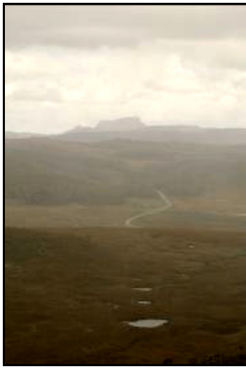
The Vale of Belvoir