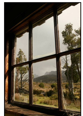
Mt Kate Hut Residence Cradle Mountain